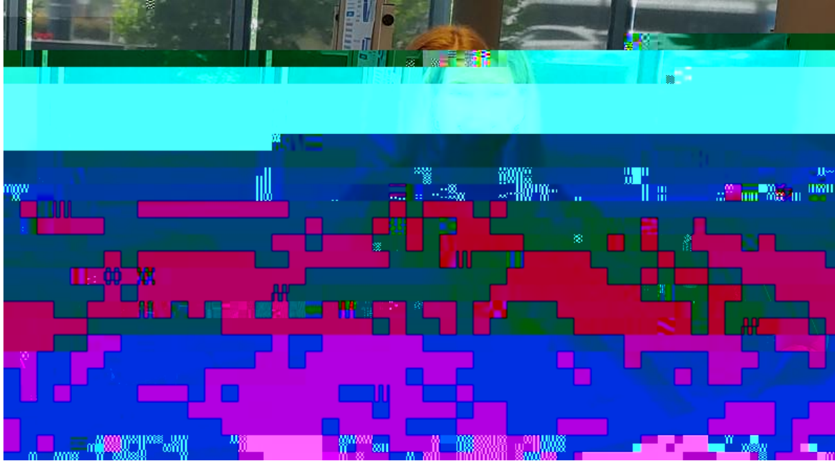
Eastern Virginia Medical School